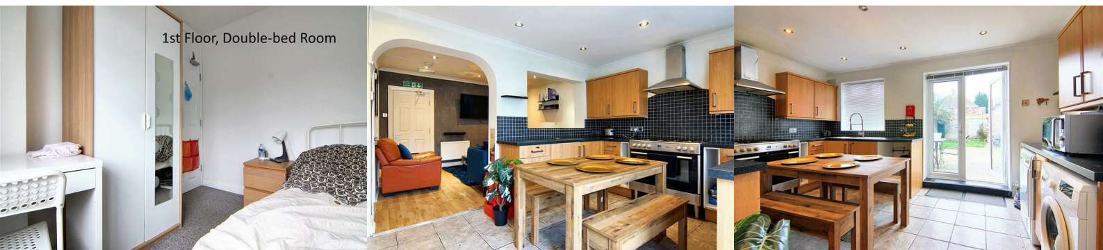
1st Floor, Double-bed Room